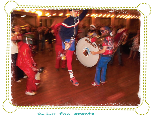
Enjoy fun events.

Be a member! You may apply online at adcd.com , or mail a printed application to the ADCD office with your payment.