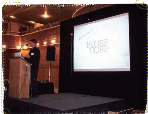
View the finest work.