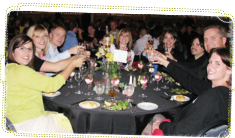
Meet local creatives.